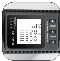
Two directions LCD display