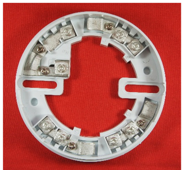
CN1041 low profile 99 mm 8-terminal continuity base