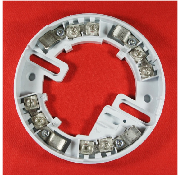
CN104A low profile 99 mm 8-terminal base