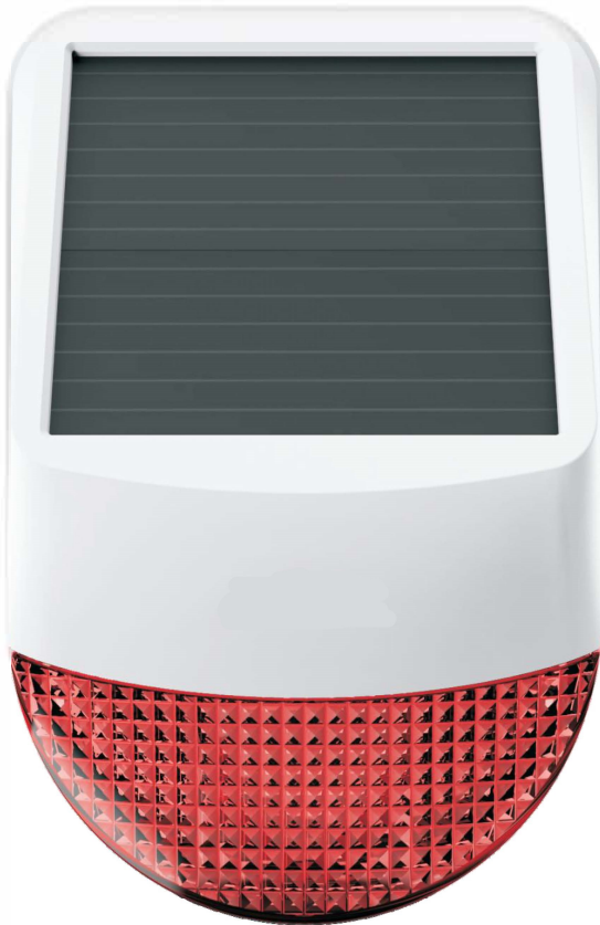
Solar Outdoor Wireless Acousto-optic Siren ST-6109S

* This product is a networking accessory that needs to be used with the company's gateway